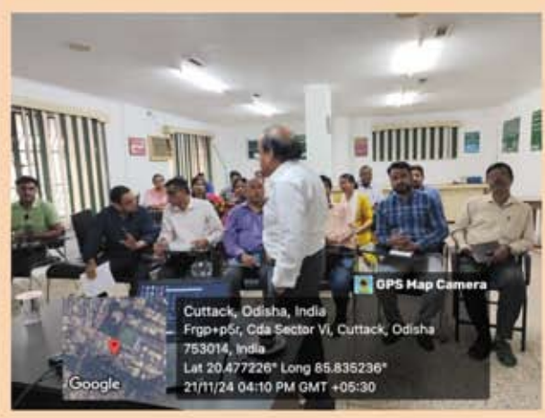
NEP 2020 Guideline Briefing to Faculty and Staff