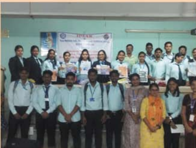
Mental Counseling by Tele Manas SCBMH