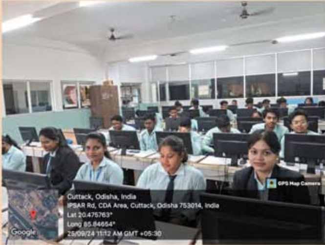
PMKVY program session