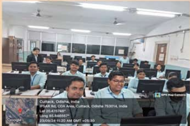
Regular Computer Lab sessions