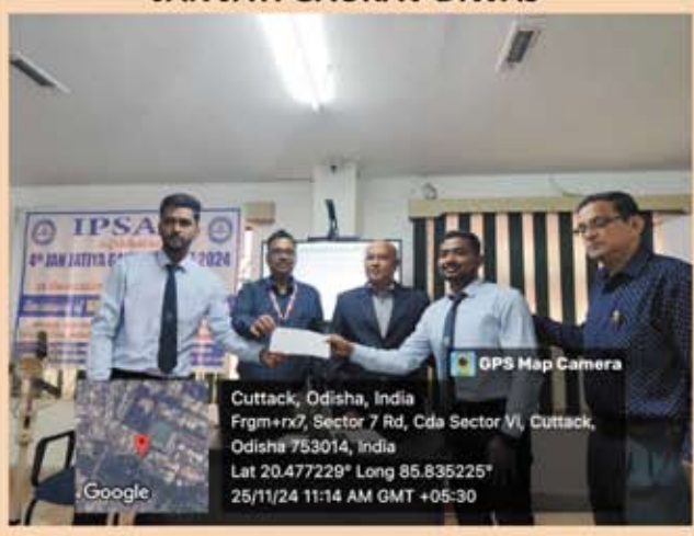
JAN JATI GAURAV DIWAS