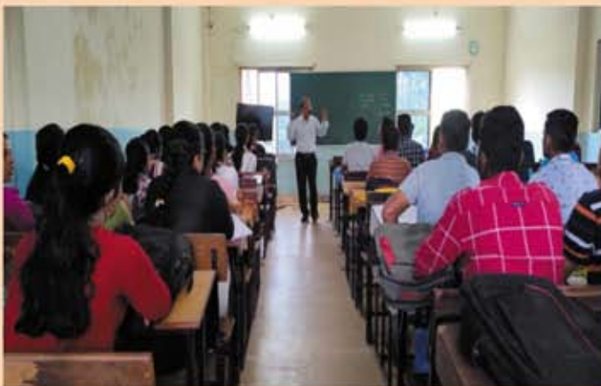
Orientation Lecture Session