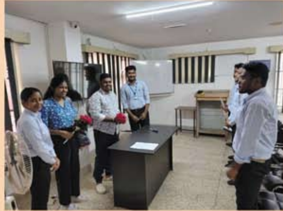
MCA Internship selection