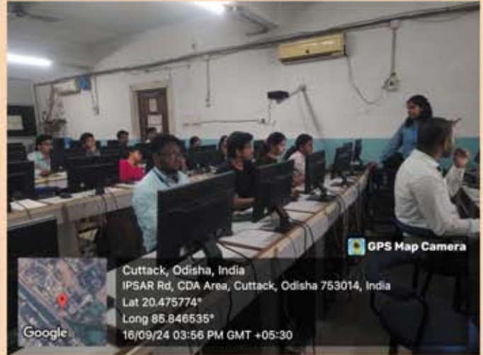
IBM Business Analytics Session