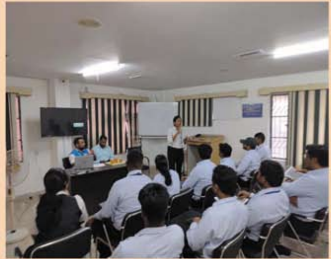
Pre Placement Session