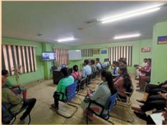
Concentrix Pool Campus