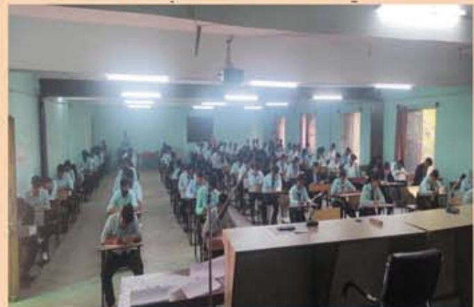
University Exam Under Progress