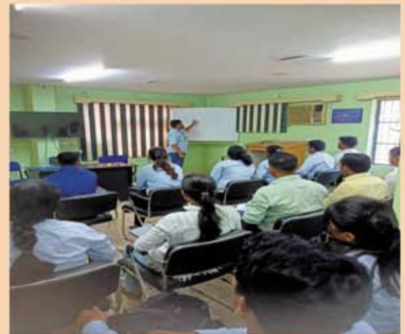
Campus Selection Process