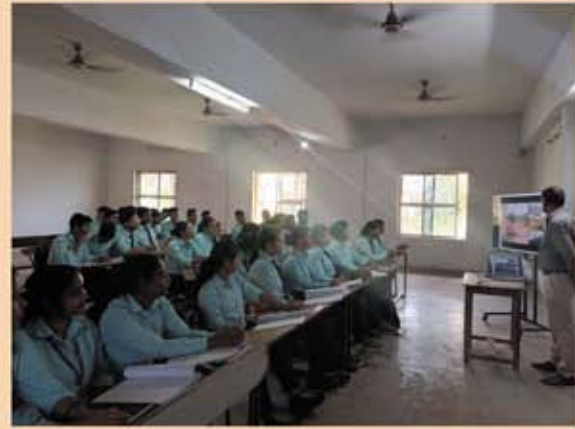
Class Room Presentation